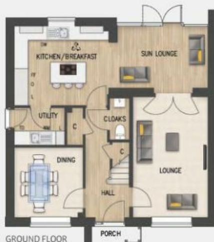
GROUND FLOOR PLOTS: 8 & 15